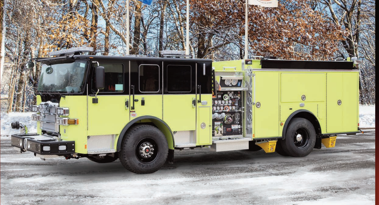
Pierce Enforcer Pumper Franklin Fire Dist.5/Star Cross Fire Co. Job #39187