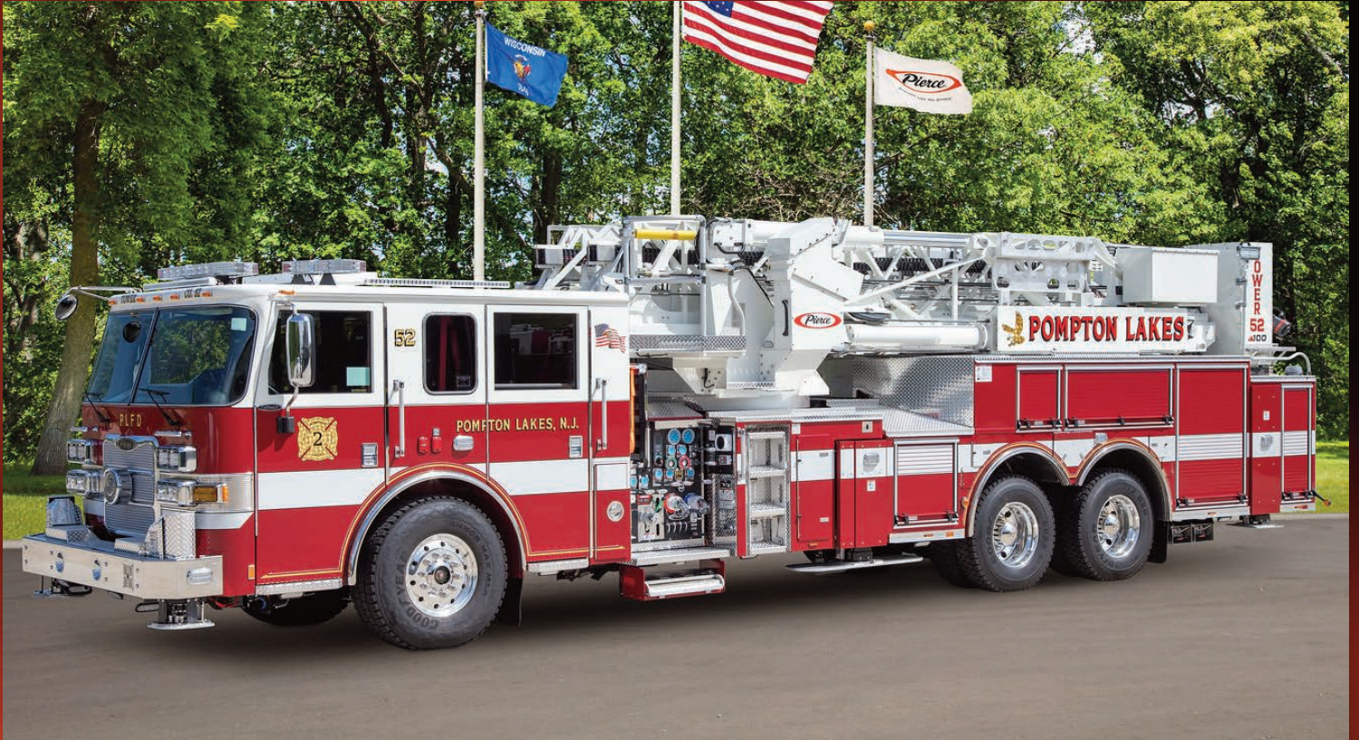
Pierce Arrow XT 100' Ascendant Mid-Mount Tower Borough of Pompton Lakes Job #37812