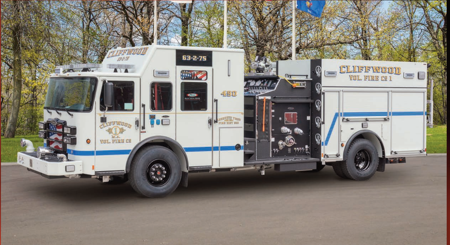
Pierce Enforcer Pumper Aberdeen Fire Dist. 2/Cliffwood Fire Co. Job #35202