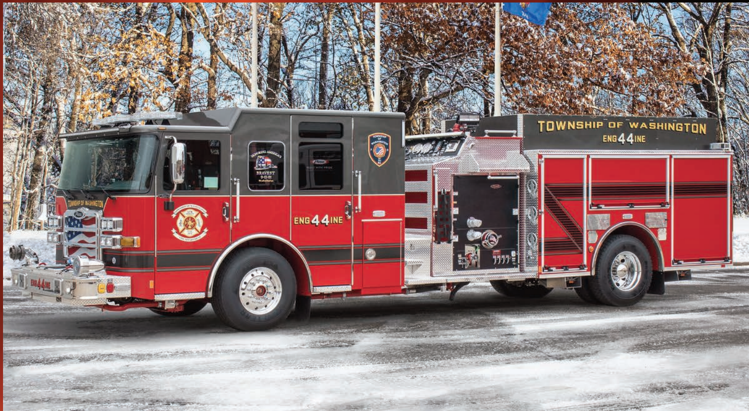
Pierce Enforcer Pumper Washington Township (Bergen County) Job #35047