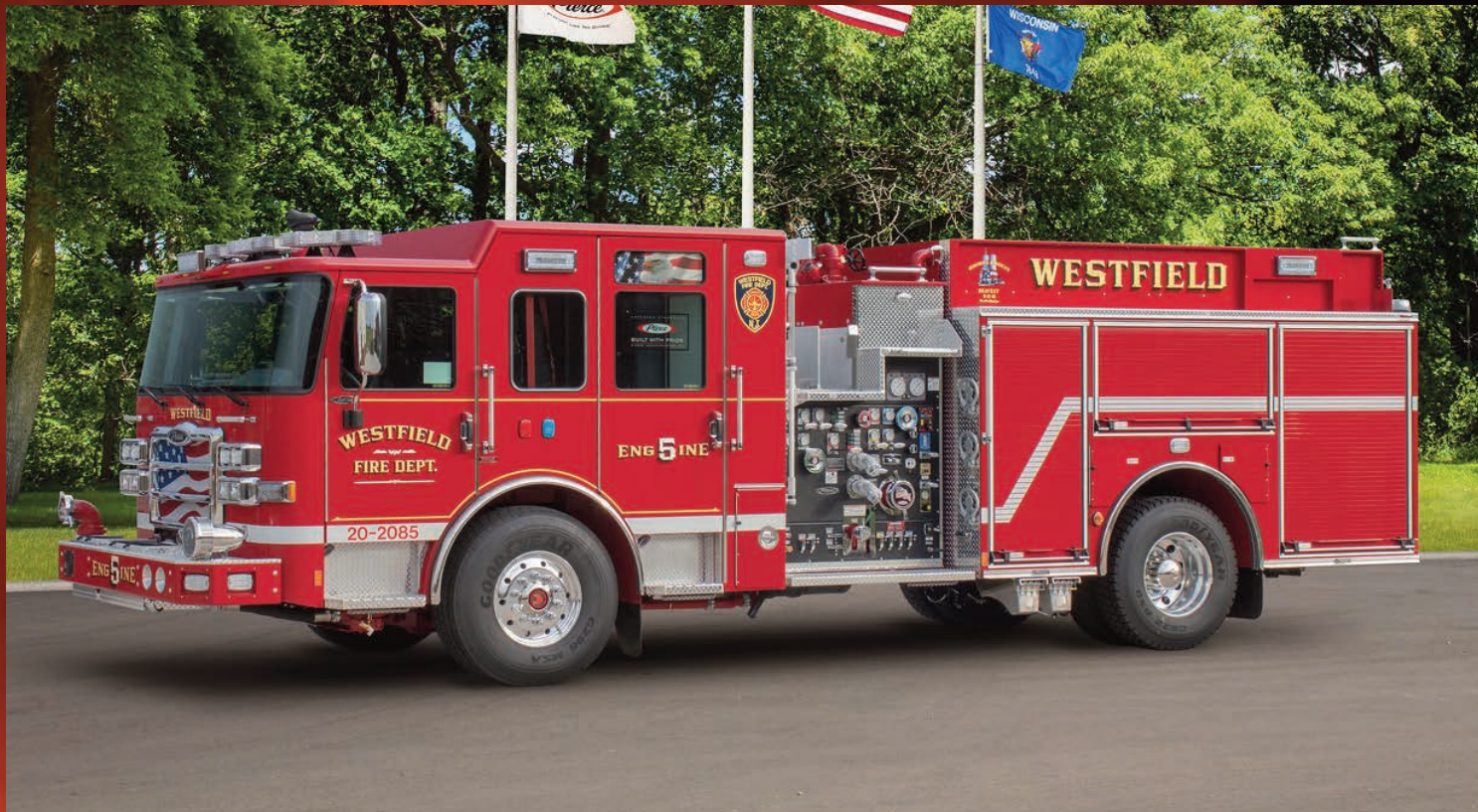
Pierce Enforcer Pumper Town of Westfield Job #34605