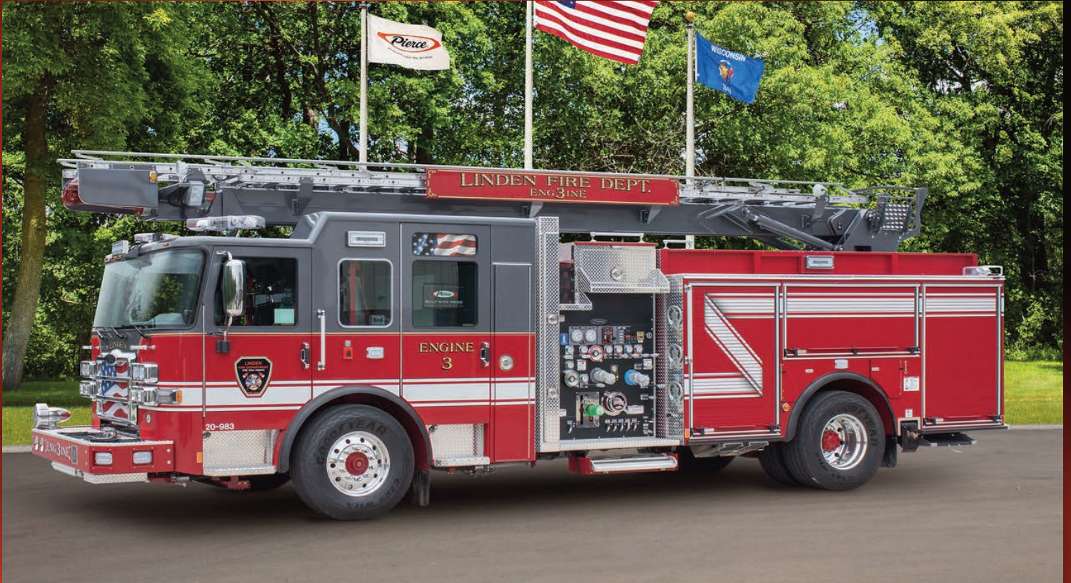
Pierce Enforcer 55' Sky-Boom City of Linden Job #34491