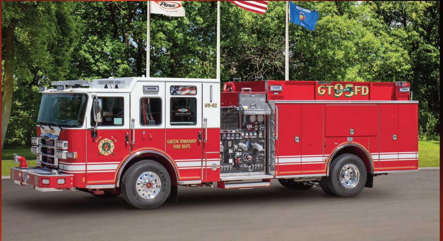
Pierce Enforcer Pumper Township of Green Job #34713