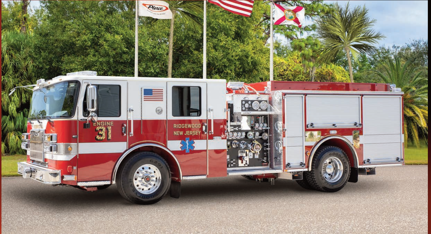
Pierce Saber Pumper Village of Ridgewood Job #34152