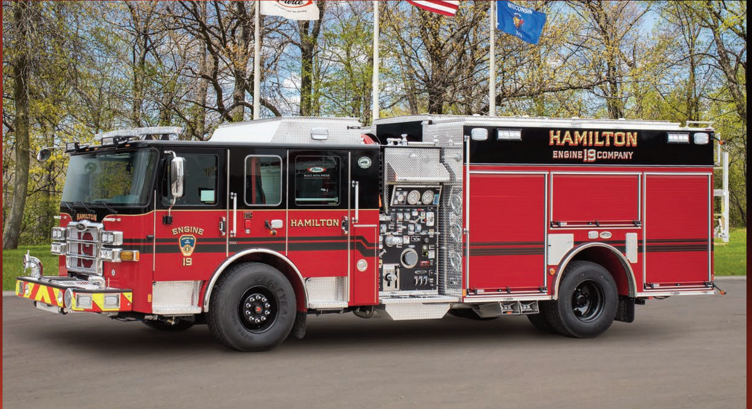
Pierce Enforcer Pumper Hamilton Township Fire District #9 Job #34296