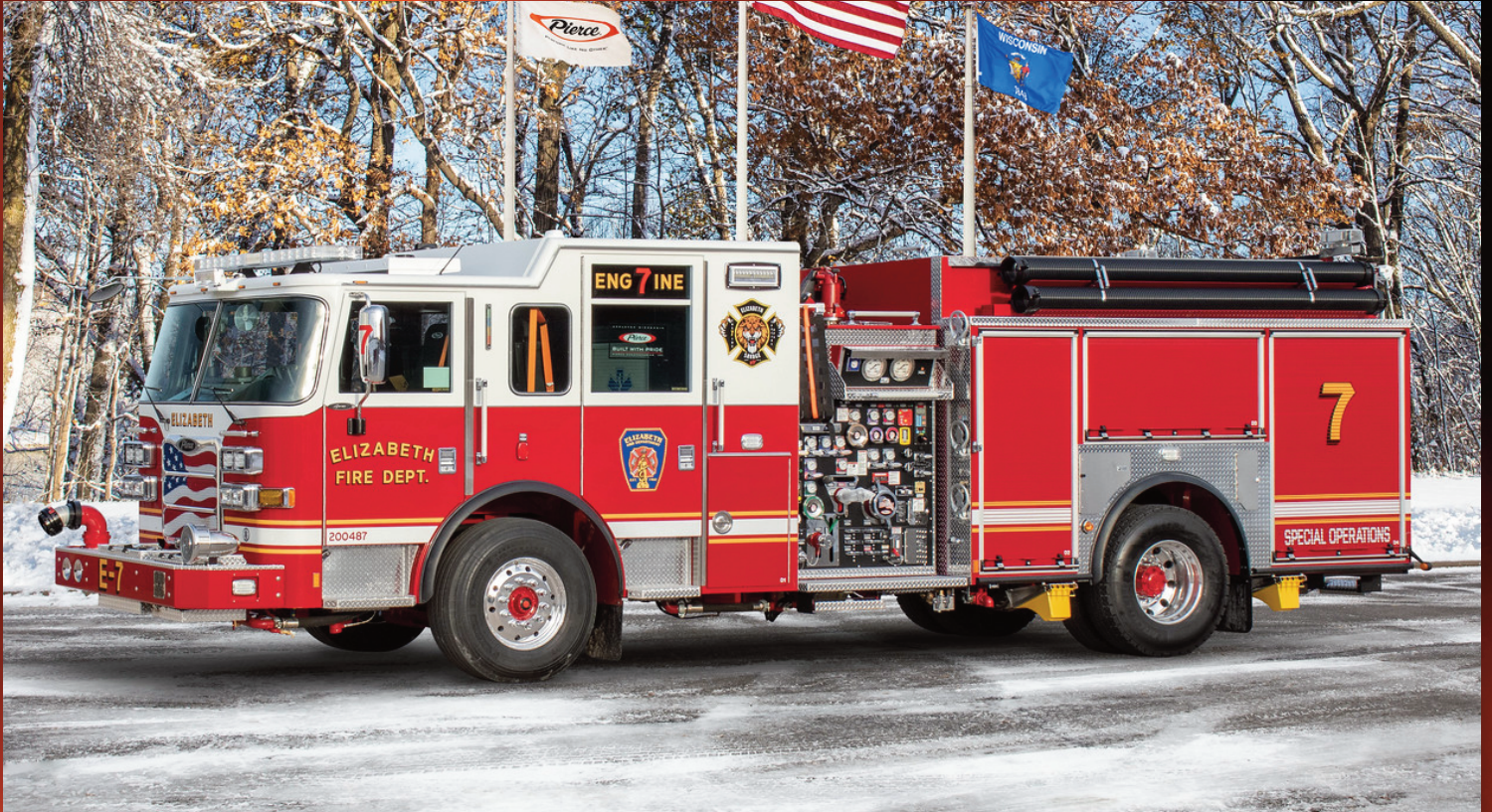
Pierce Arrow XT Pumper City of Elizabeth Job #34041