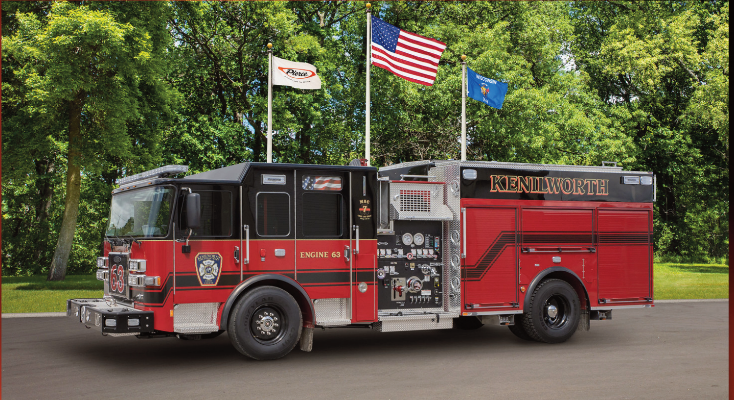
Pierce Saber Pumper Borough of Kenilworth Job #33319