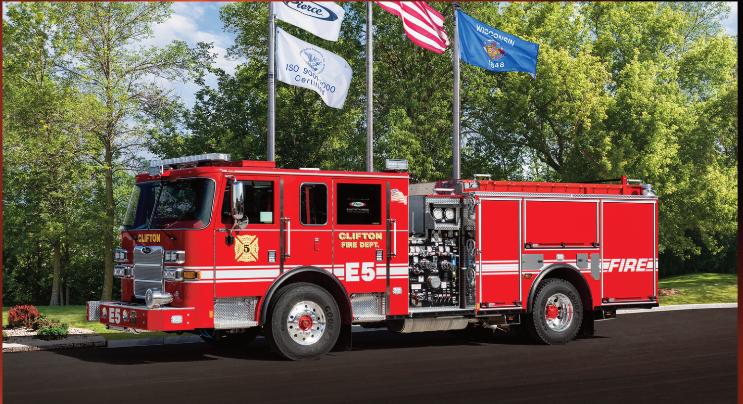
Pierce Arrow XT Pumper City of Clifton Job #33513