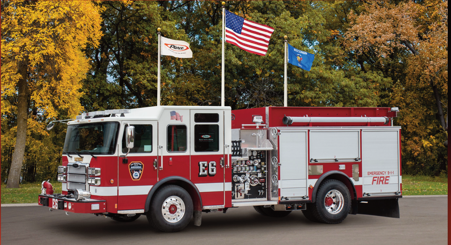
Pierce Enforcer Pumper City of Bayonne Job #33737