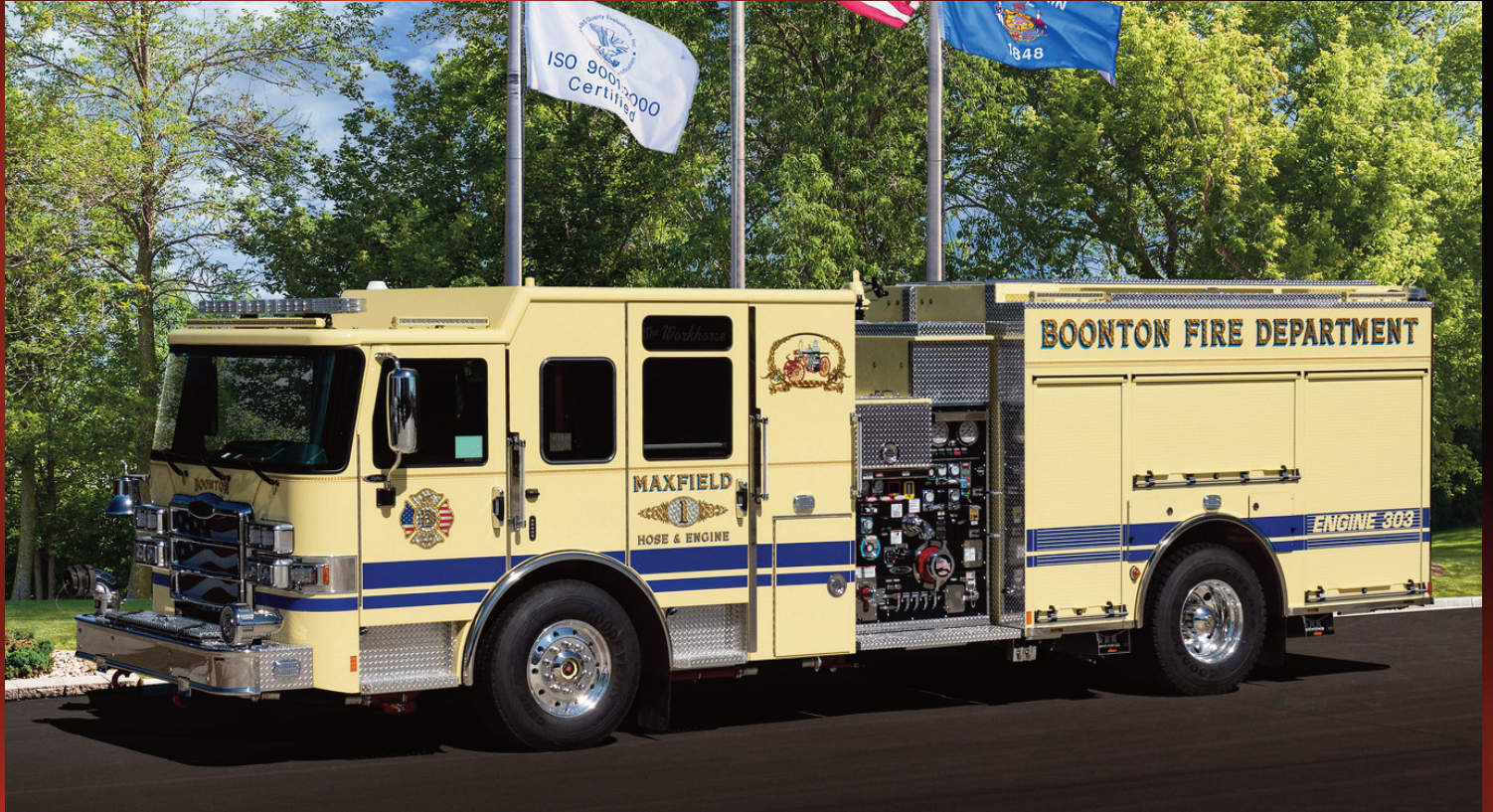
Pierce Enforcer Pumper Town of Boonton Job #33338