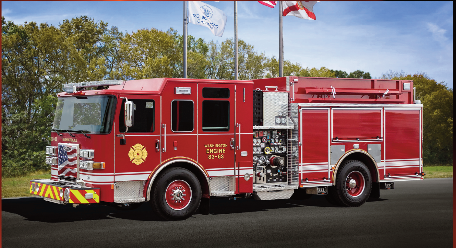
Pierce Saber Pumper Borough of Washington (Warren County) Job #32888