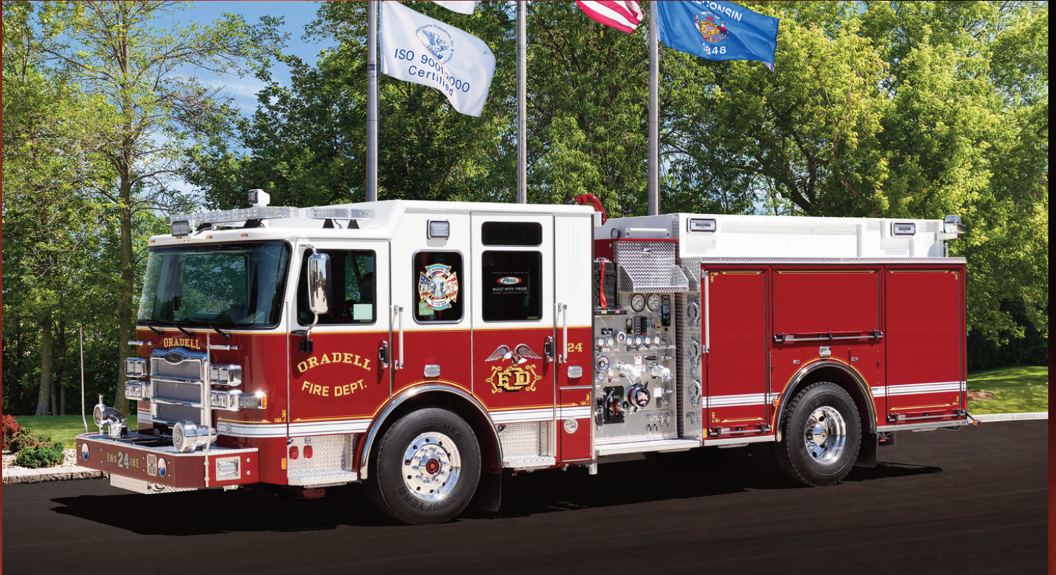
Pierce Enforcer Pumper Borough of Oradell Job #33296