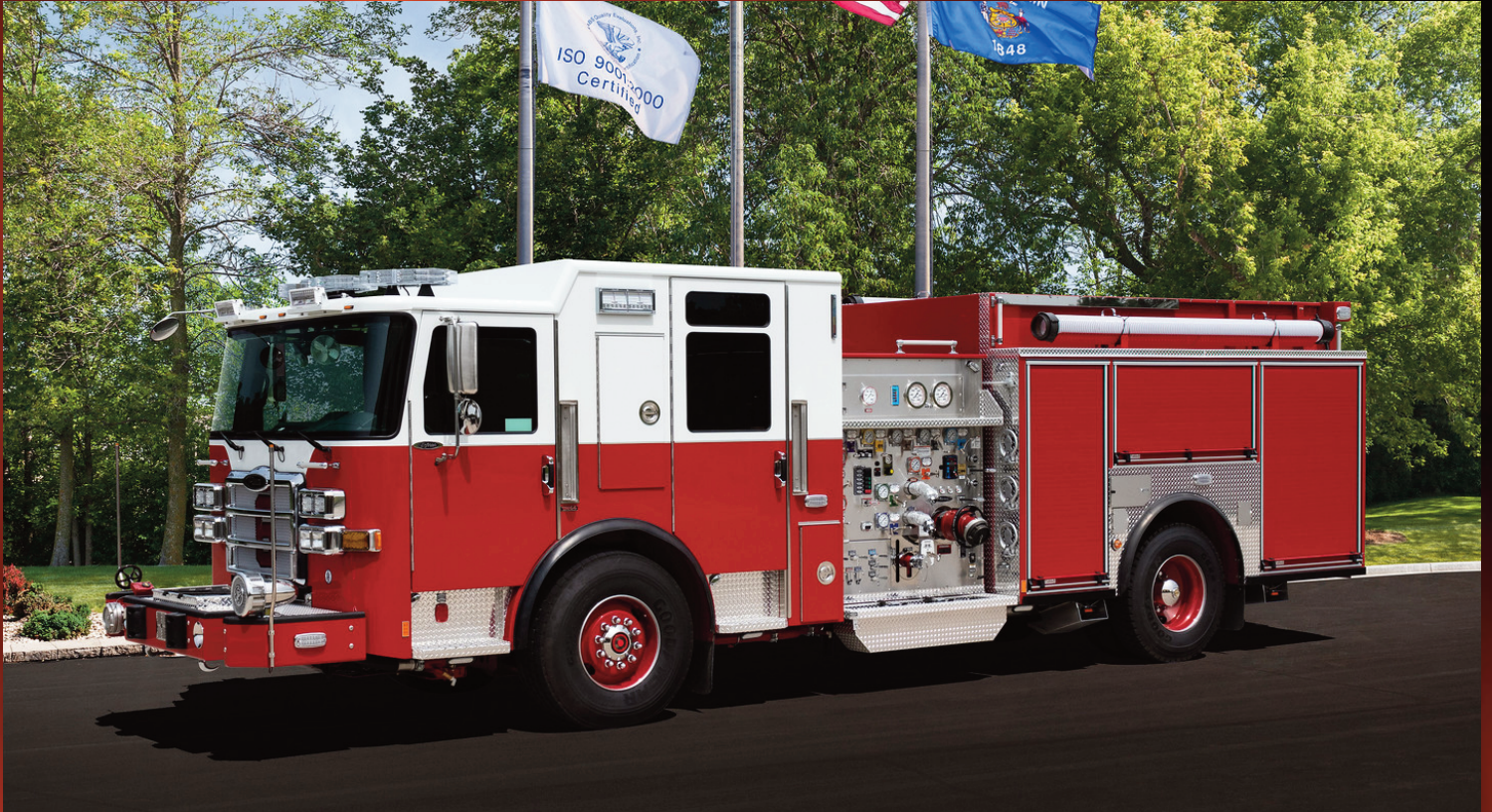
Pierce Enforcer Pumper City of Jersey City Job #33080