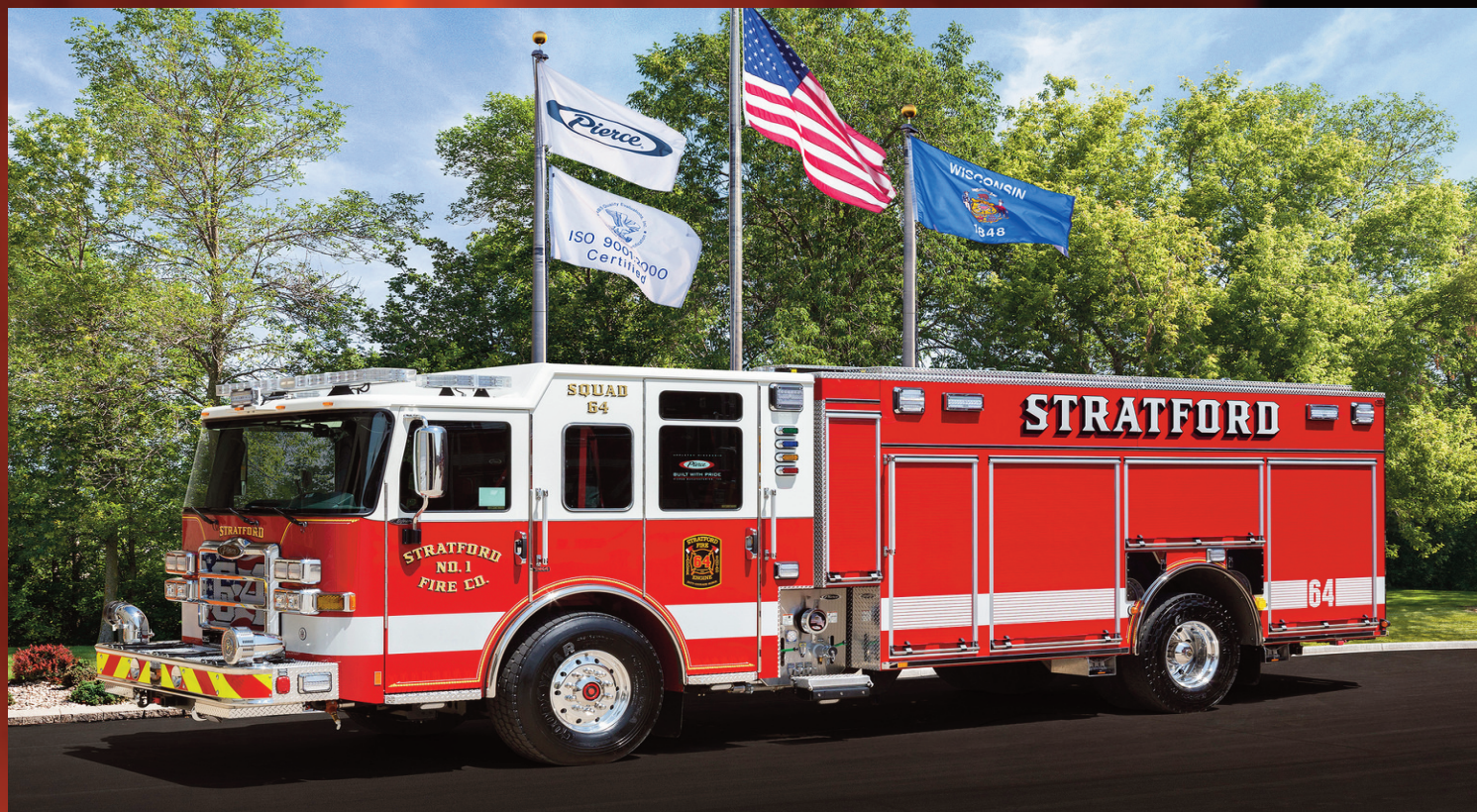
Pierce Enforcer PUC Pumper Borough of Stratford Job #31797