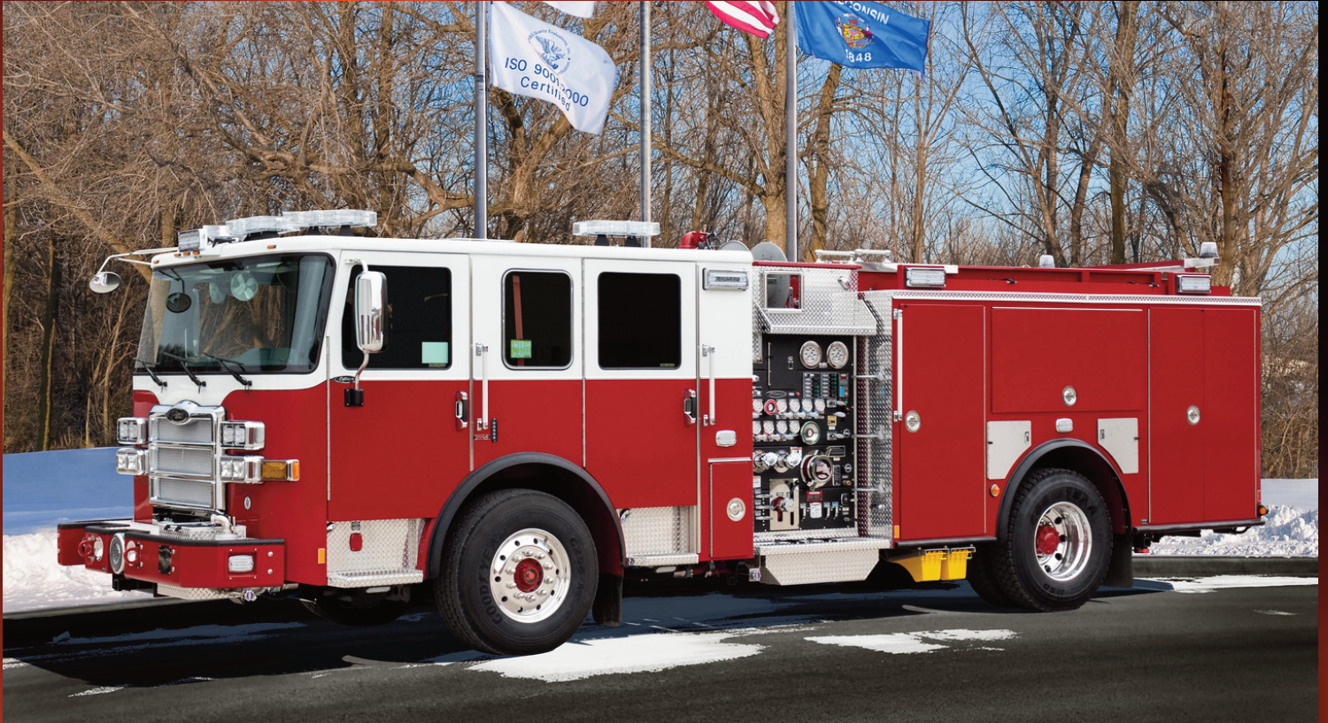
Pierce Enforcer Pumper Pennsauken Township Job #32537-02