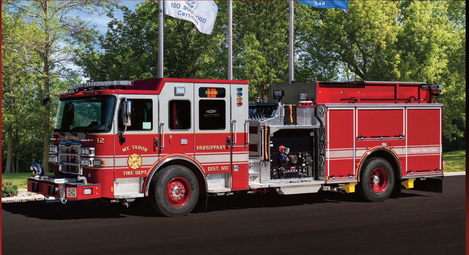
Pierce Enforcer Top Mount Pumper Parsippany-Troy Hills Fire Dist. #1/Mt. Tabor Fire Co. Job #32171