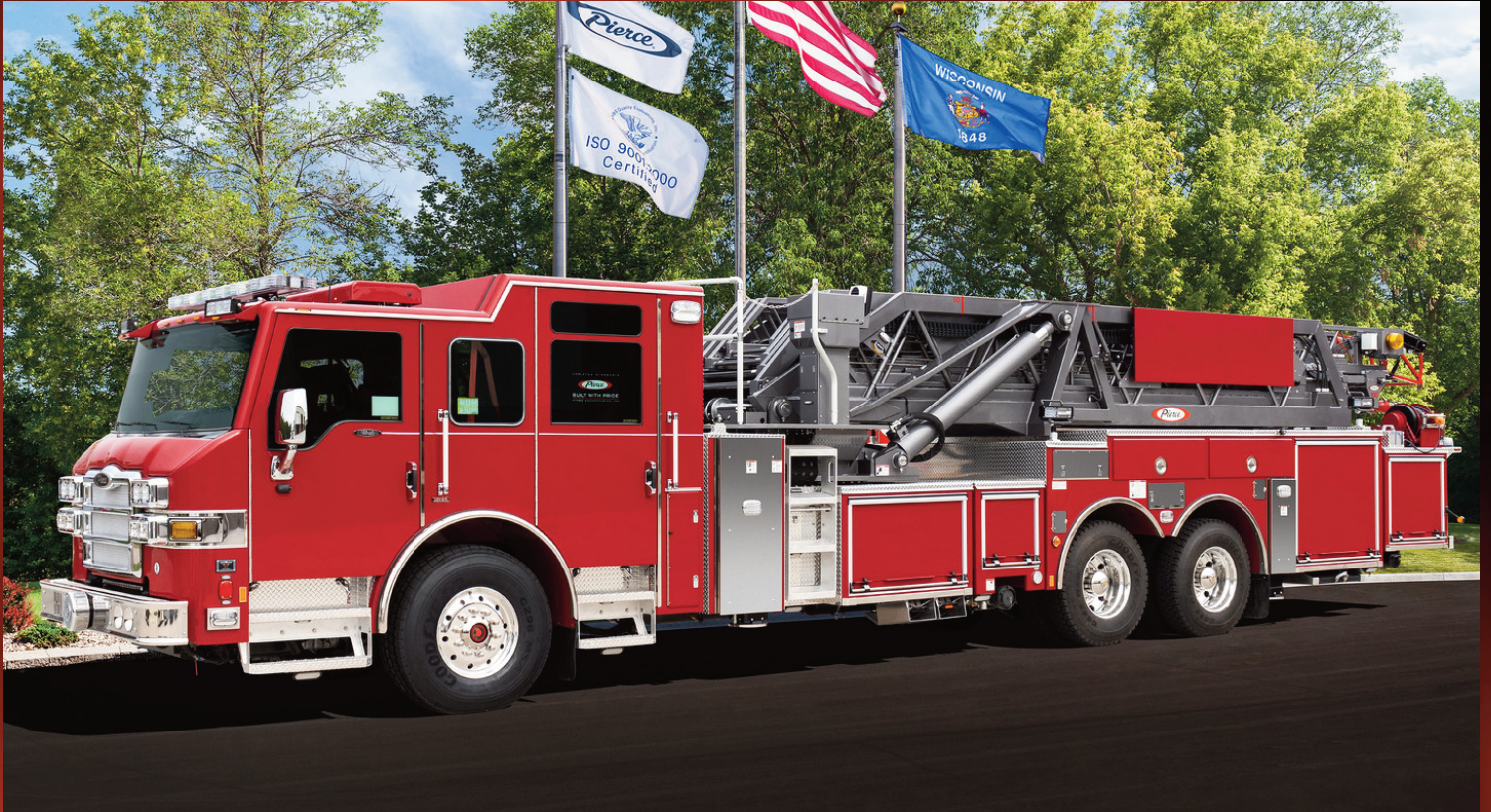
Pierce Velocity 100' Mid-Mount Ladder Borough of Palmyra Job #32156