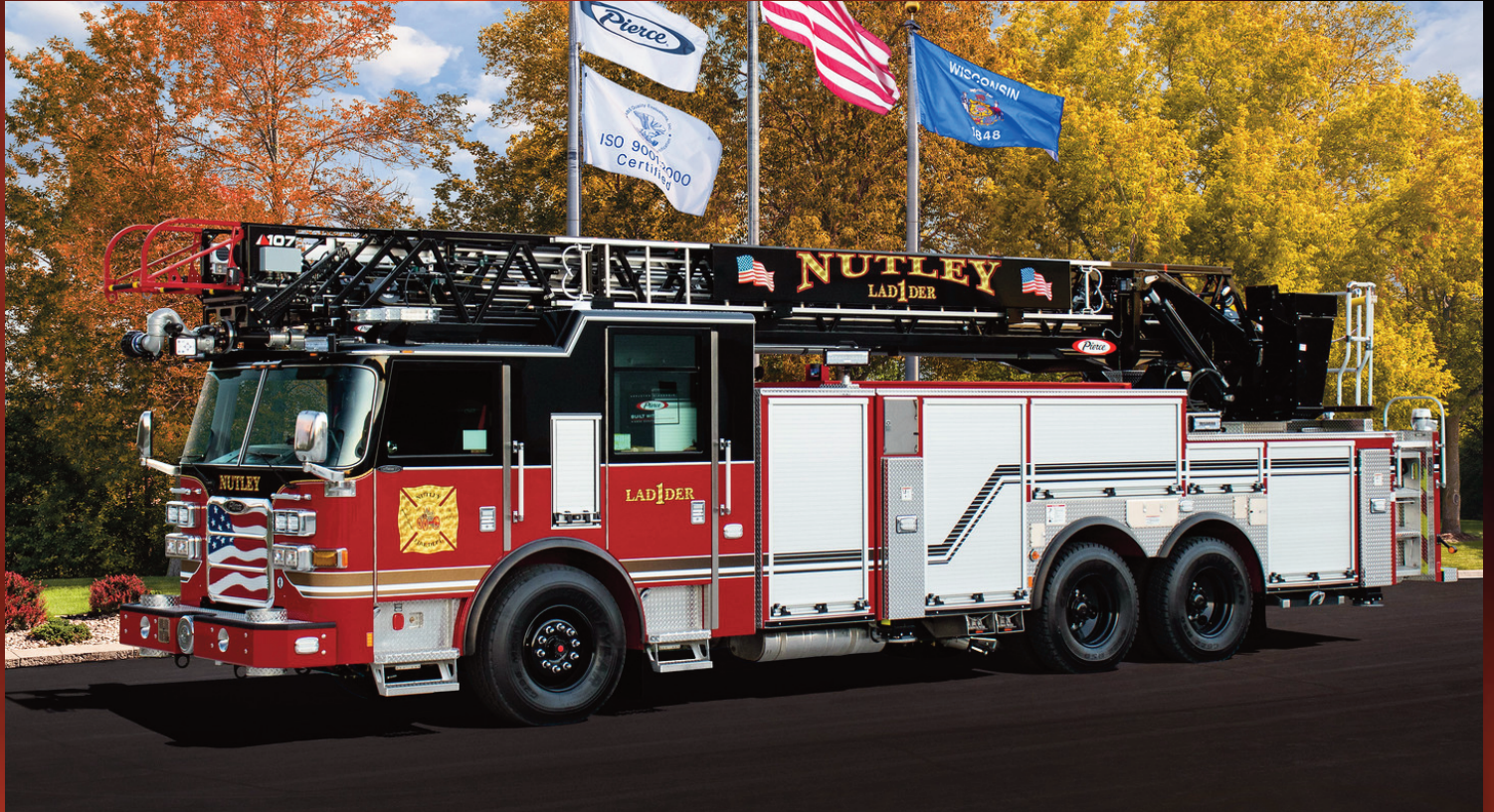
Pierce Arrow XT 107' Ascendant Aerial Ladder Township of Nutley Job #32219