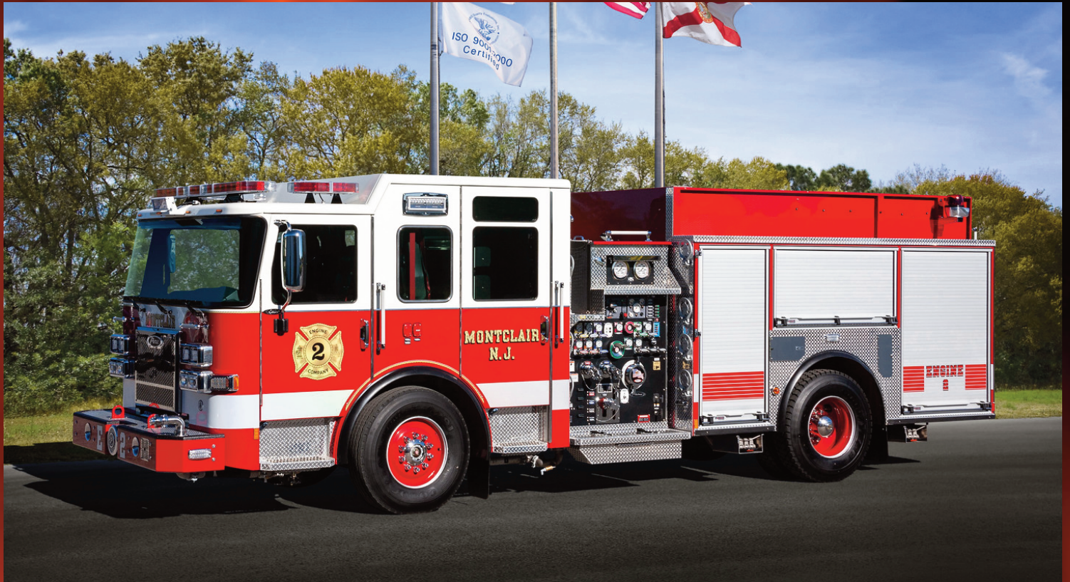
Pierce Saber Pumper Township of Montclair Job #31960-01