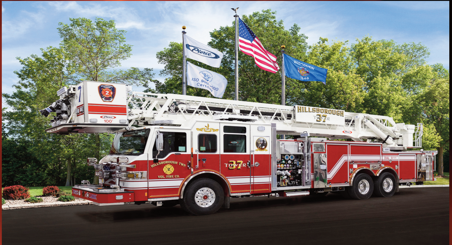
Pierce Velocity 100' Platform Hillsborough Twp. Fire Dist./Hillsborough Fire Co. 2 Job #31487