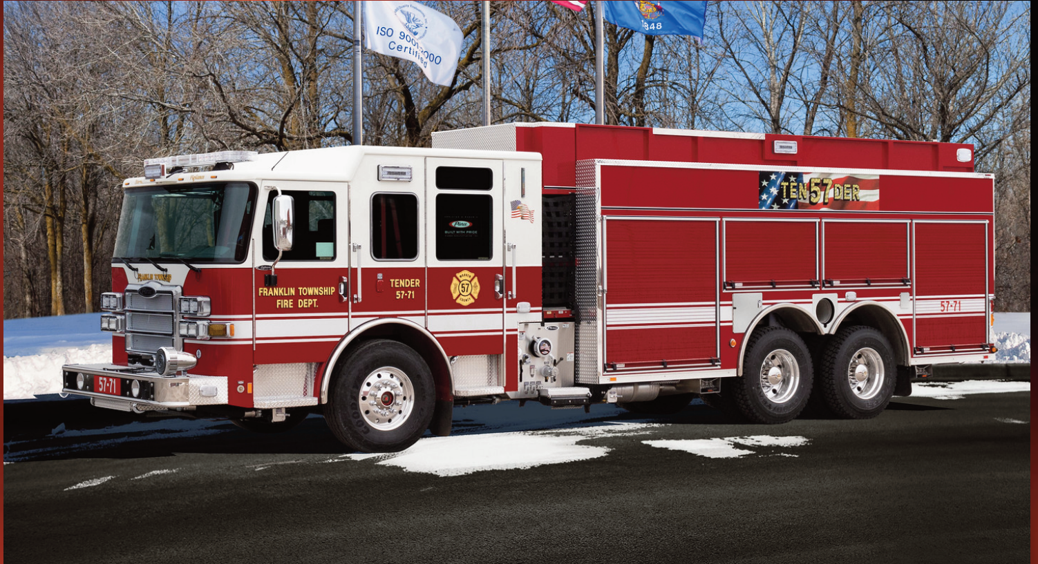
Pierce Enforcer PUC Tanker/Pumper Franklin Township (Warren County) Job #32920