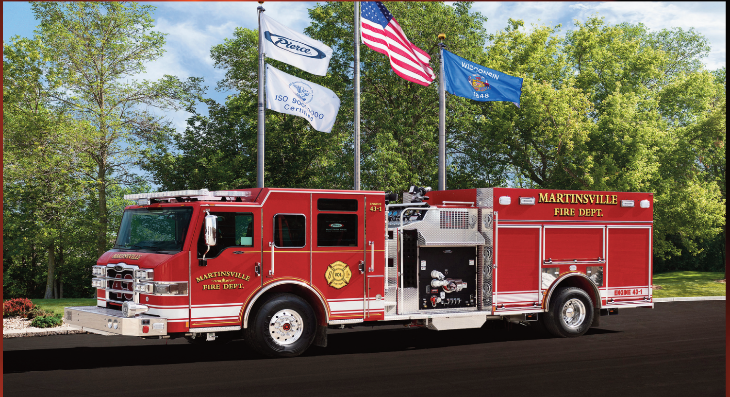
Pierce Velocity Top Mount Pumper Bridgewater Fire Dist. 1/Martinsville Fire Co. Job #31588