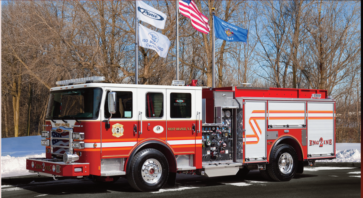
Pierce Enforcer Pumper Township of West Orange Job #31634