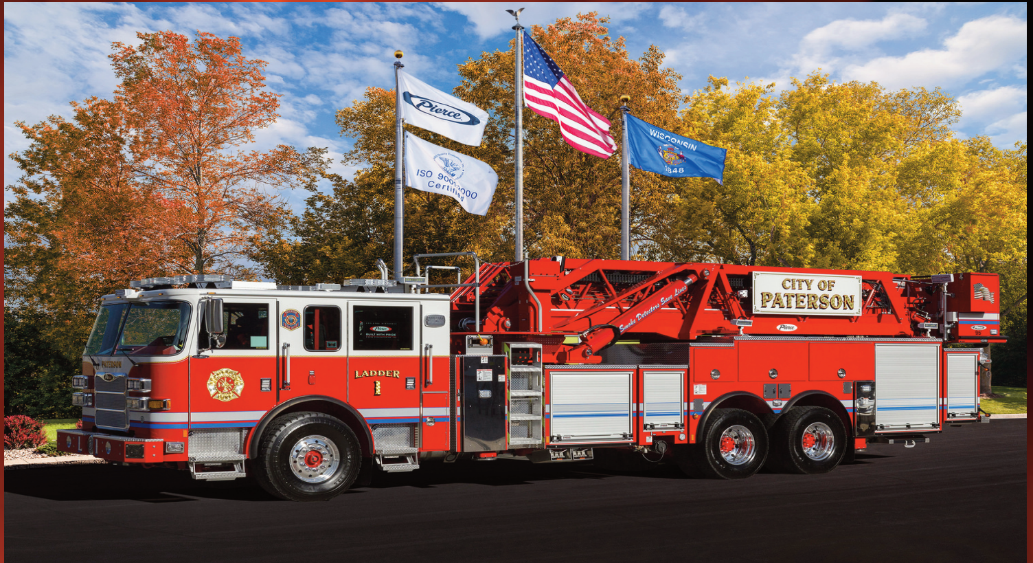
Pierce Arrow XT 95' Midmount Platform City of Paterson Job #30896