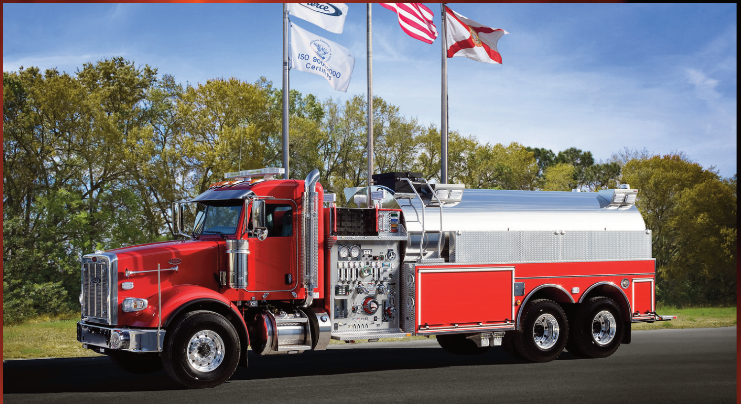
Pierce Peterbilt 367 6x4 Elliptical Tanker Medford Township Job #31265