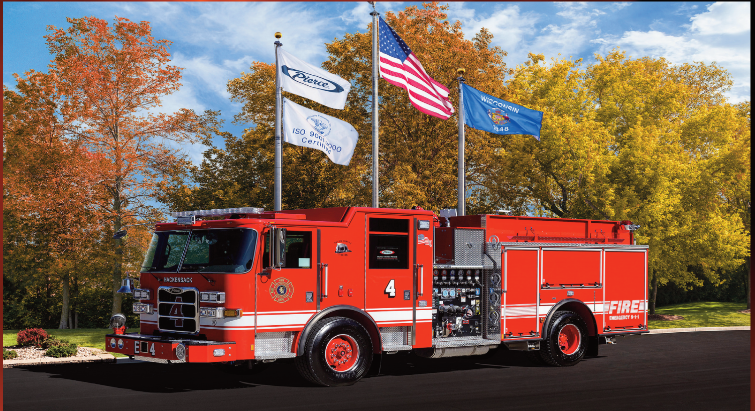
Pierce Arrow XT Pumper City of Hackensack Job #31096