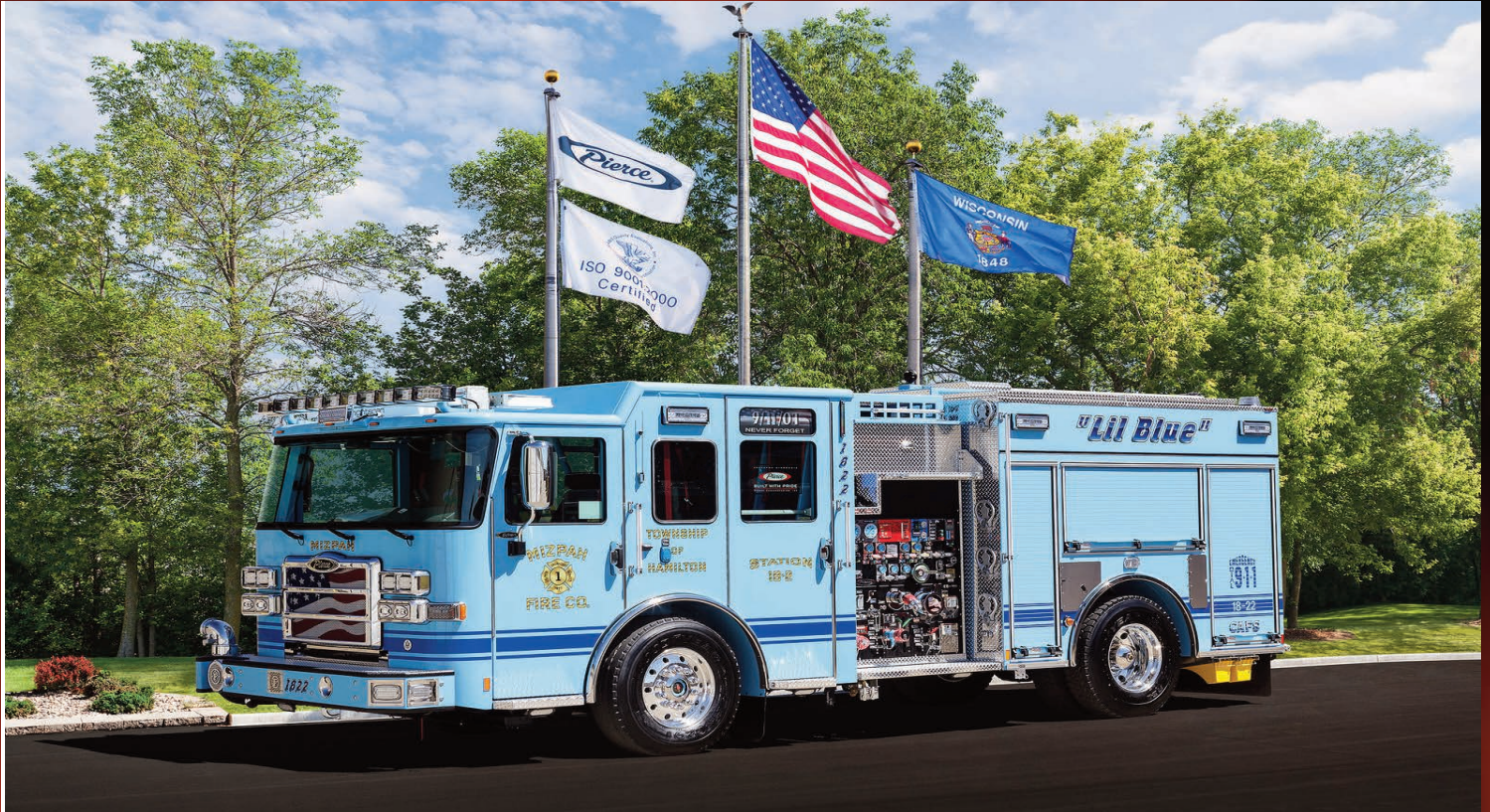
Pierce Enforcer Pumper Hamilton Township/Mizpah Fire Company Job #30639