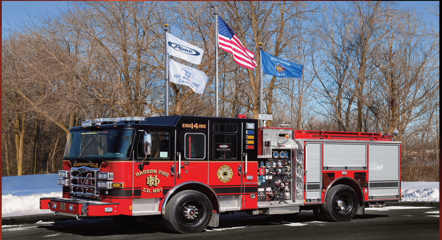
Pierce Enforcer Pumper Borough of Haddonfield Job #30480