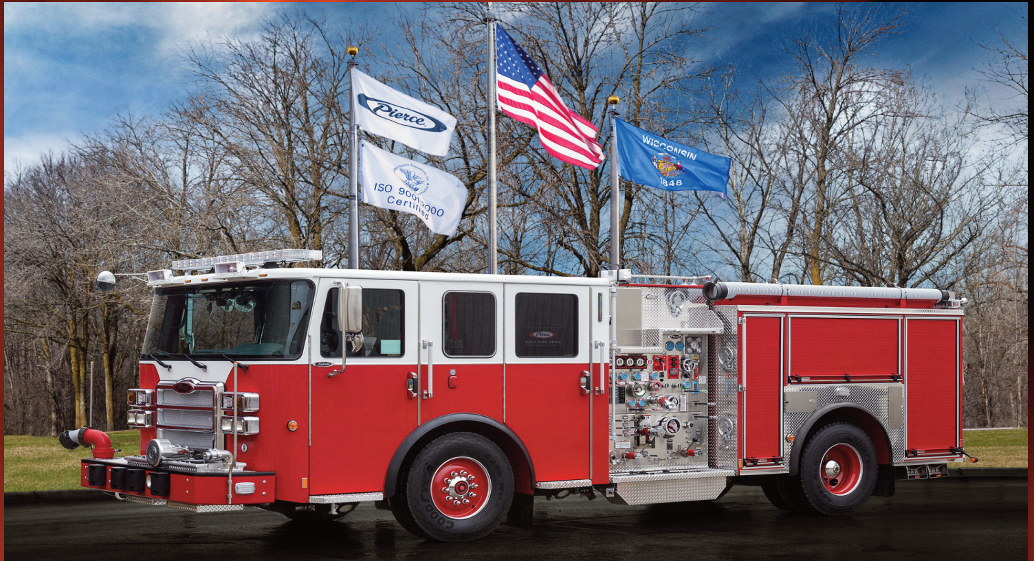
Pierce Enforcer Pumper City of Jersey City Job #30309