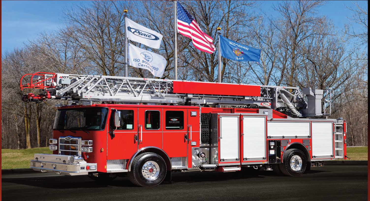
Pierce Enforcer 107' Ascendant PUC Aerial Ladder Gloucester Fire Dist #5/Lambs Terrace FC Job #30121