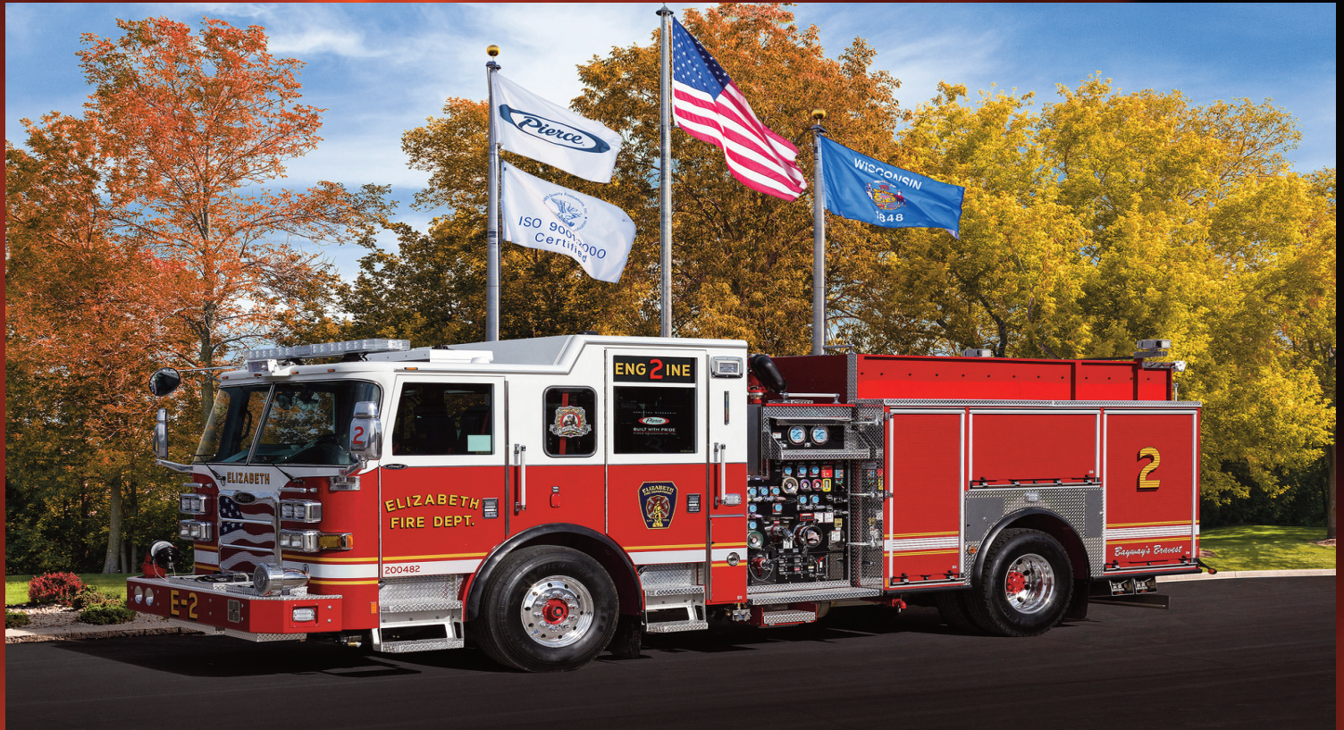
Pierce Arrow XT Pumper City of Elizabeth Job #29993-01