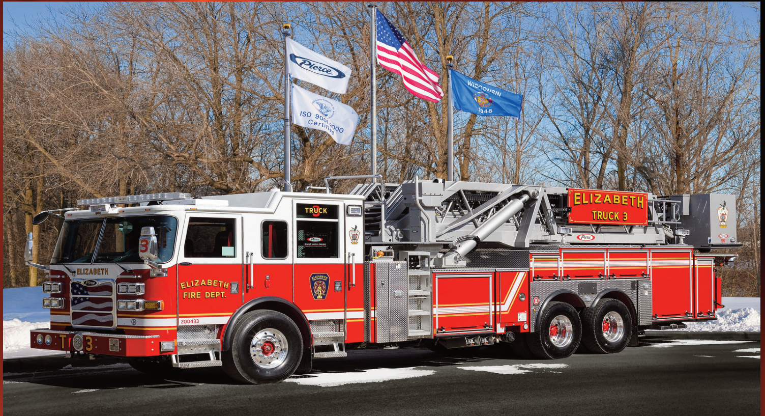
Pierce Arrow XT 95' Midmount Platform City of Elizabeth Job #29992