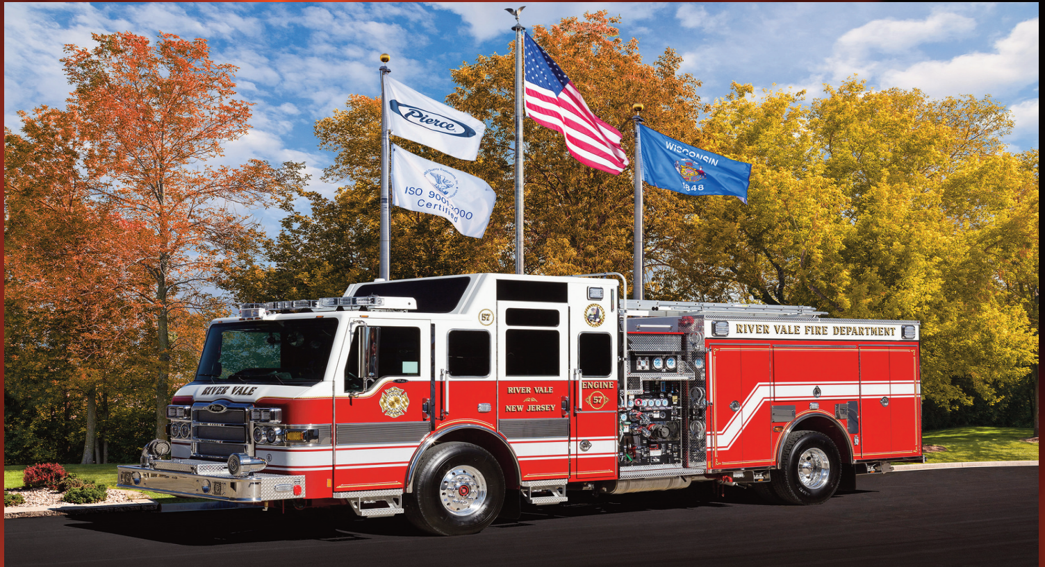
Pierce Velocity Pumper Township of River Vale Job #29733