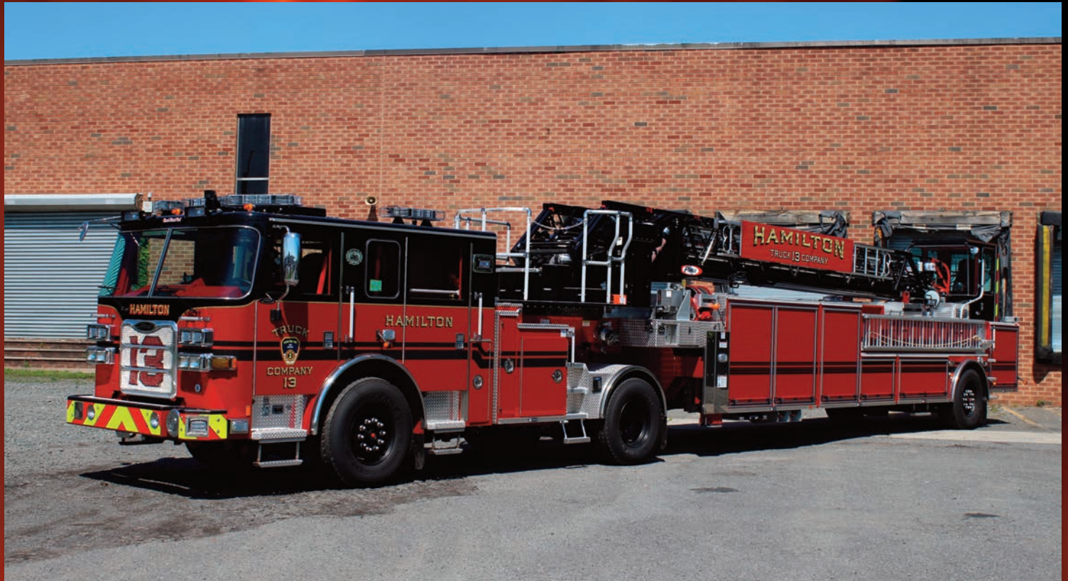
Pierce Arrow XT Tiller Hamilton Township Fire District 3 Job #29206