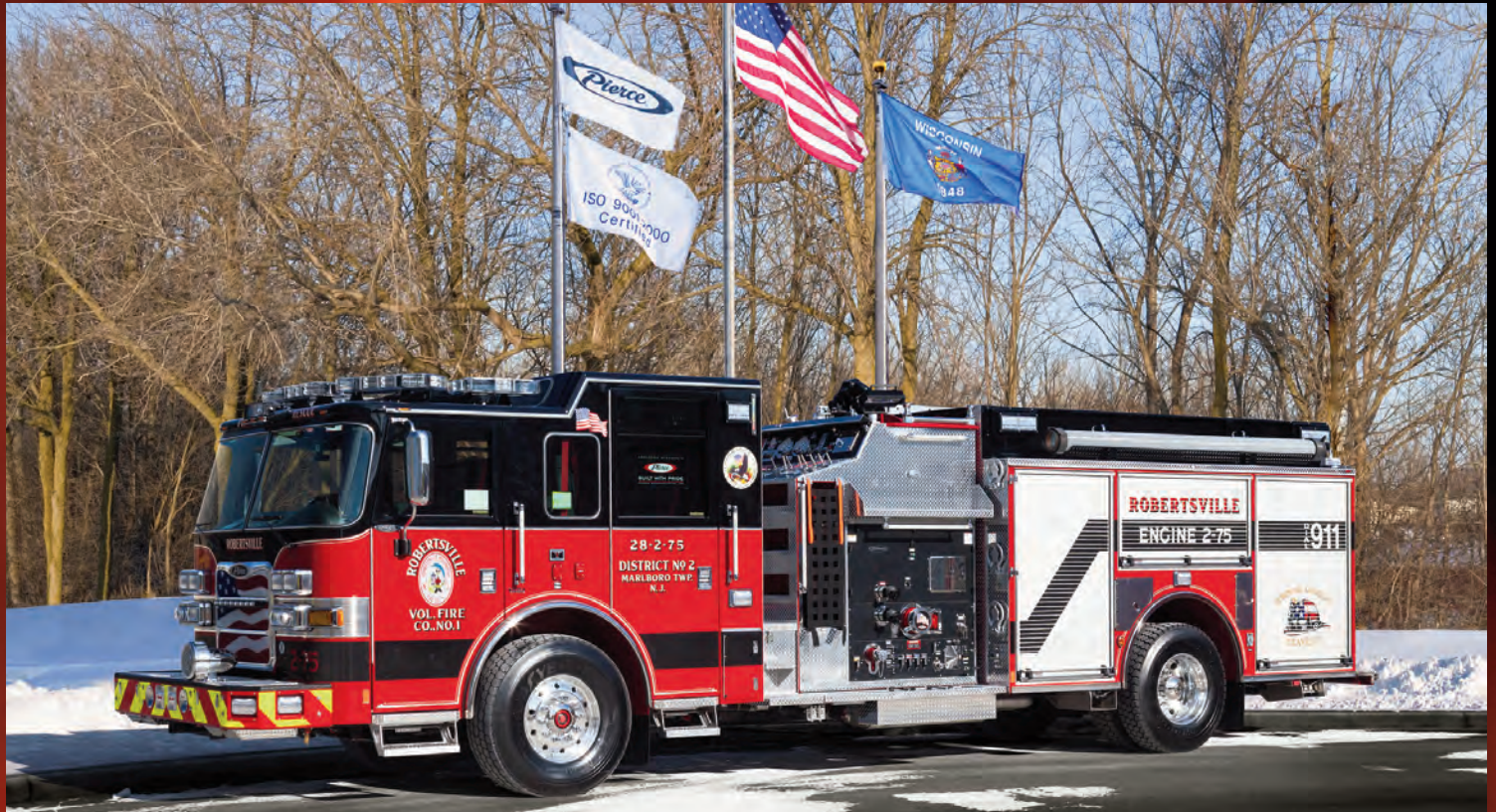
Pierce Arrow XT Pumper Marlboro Township District No. 2 Job #29005