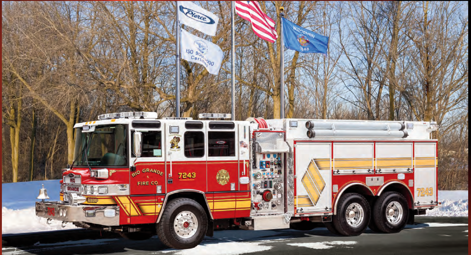
Pierce Quantum Tanker/Pumper Middle Township Fire District #2 Job #28827