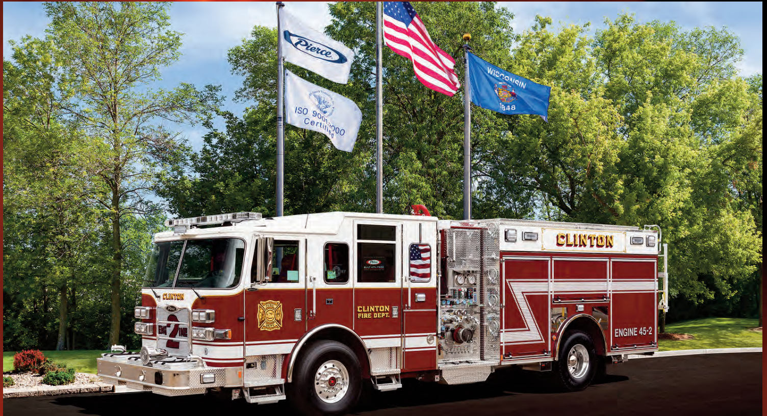
Pierce Arrow XT Pumper Town of Clinton Job #28532