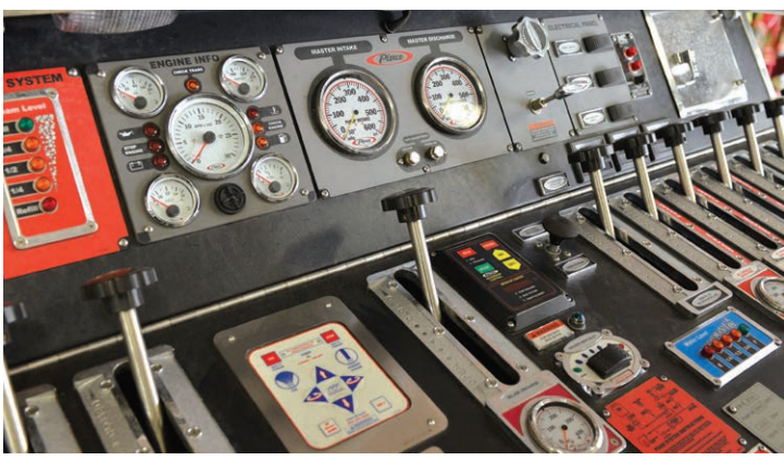
PUC top mount pump pane