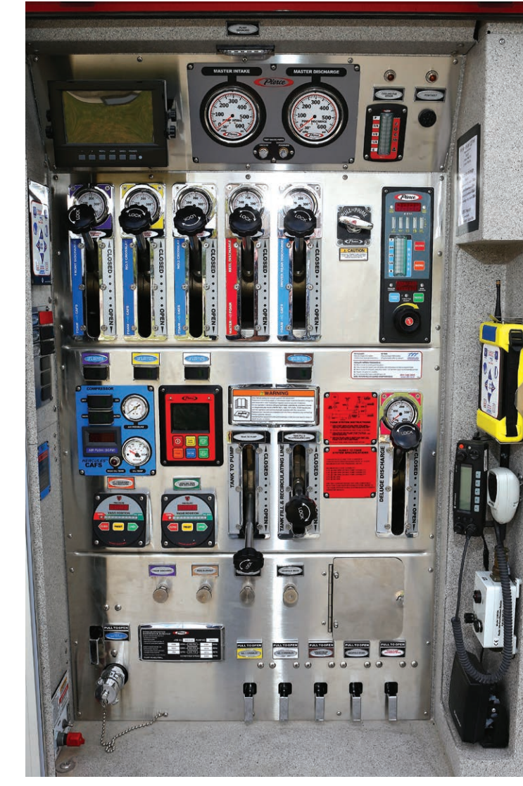
PUC side mount pump panel