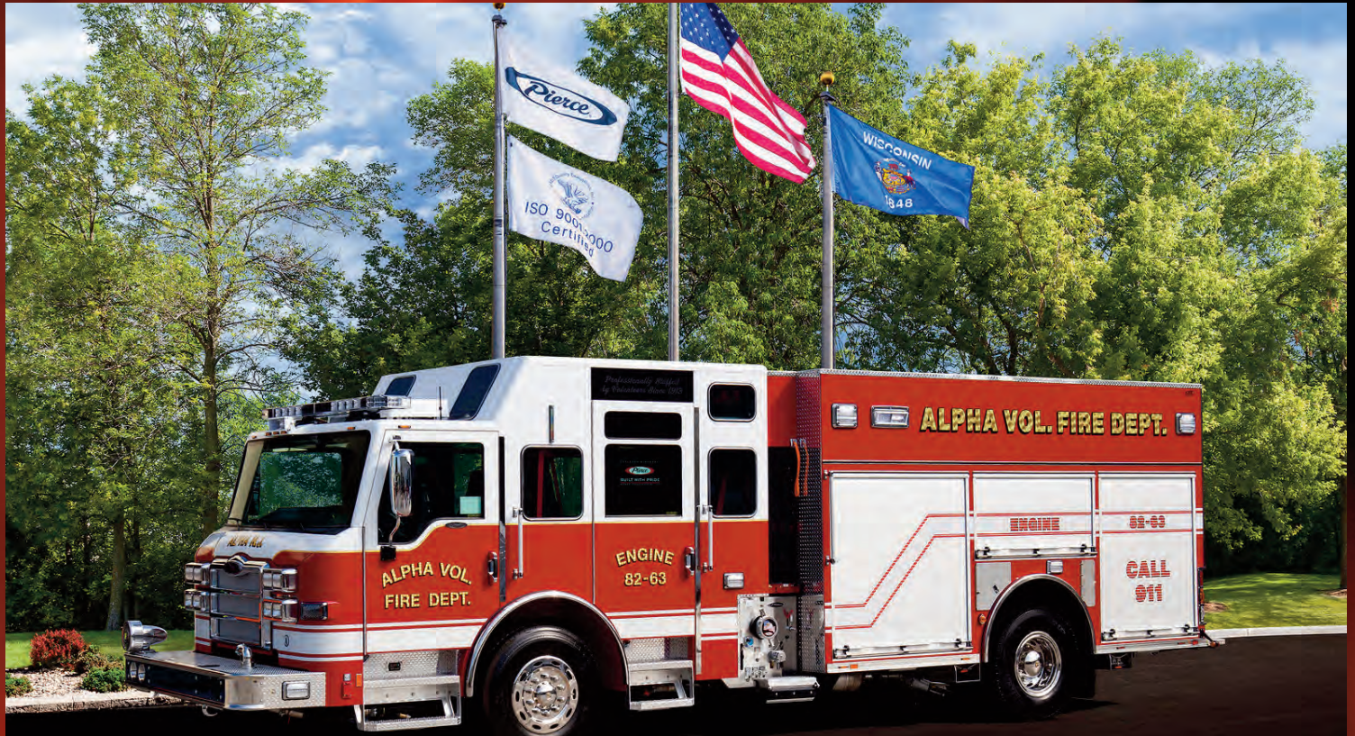
Pierce Impel PUC Pumper Borough of Alpha Job #28618