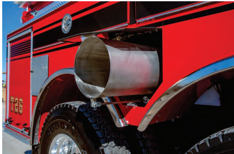
Side dump. Shown on a pumper tanker.