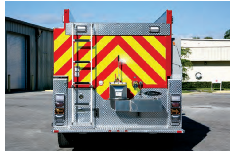
Swivel dump valve and safe access to hosebed. Shown on an FX.