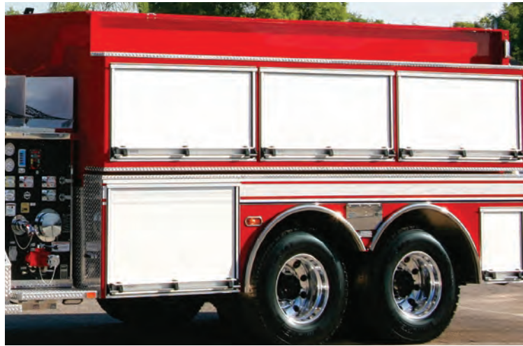
High side compartmentation. Shown on an FX.