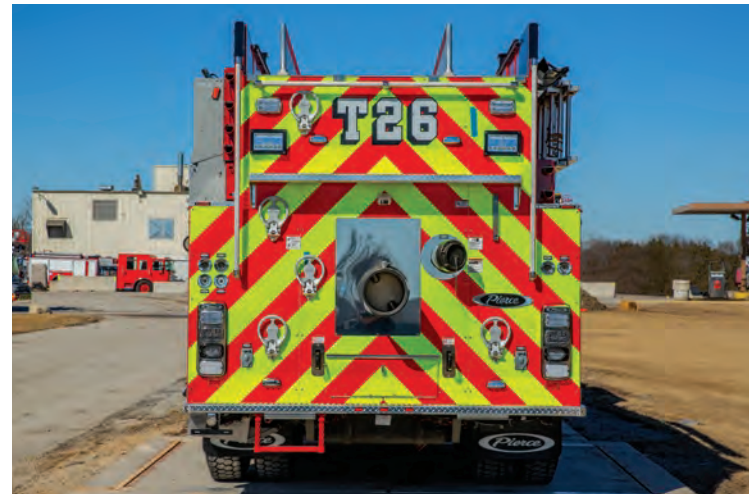
Rear dump. Shown on a pumper tanker.