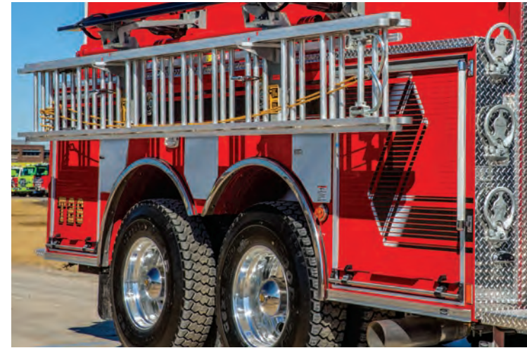
Drop down ladder rack storage. Shown on a pumper tanker.