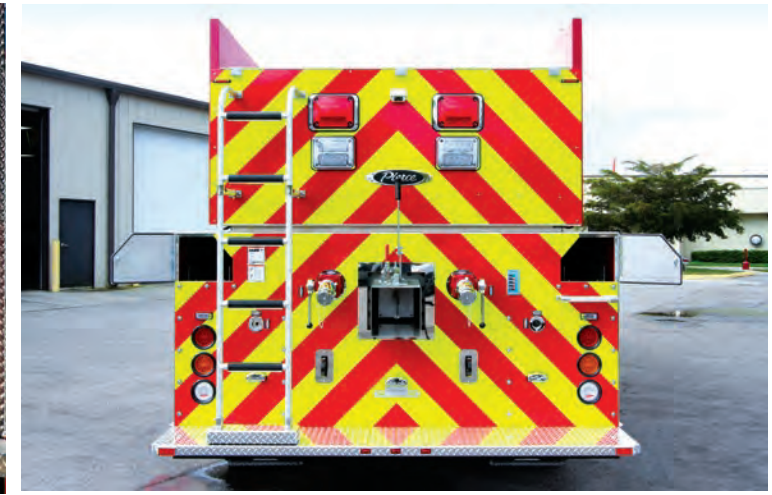
Integral suction hose storage. Shown on a dry-side.