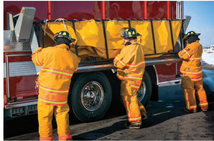
Swing down folding tank storage. Shown on a pumper tanker.