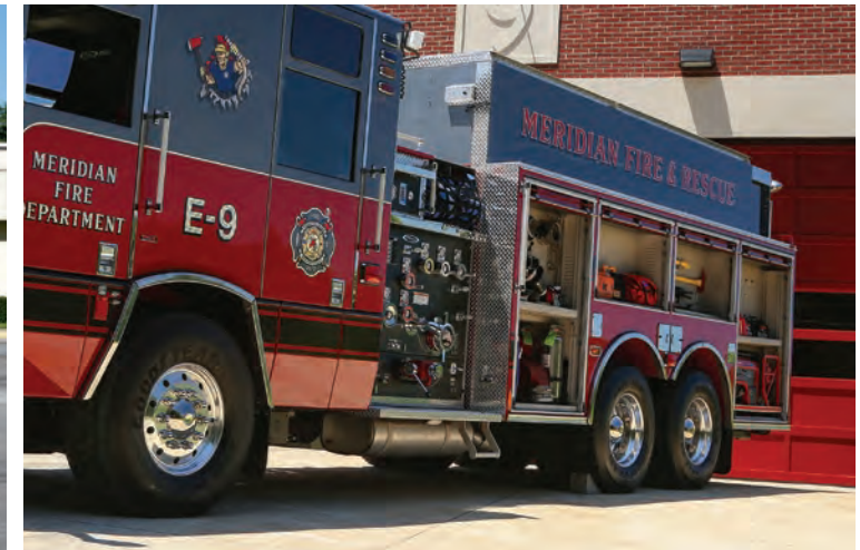
Large compartment capacity. Shown on a pumper tanker.