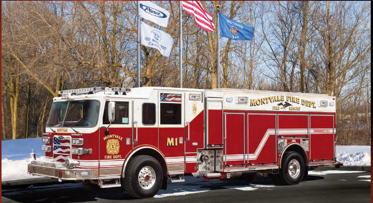
Pierce Arrow XT PUC Pumper Borough of Montvale Job #29050