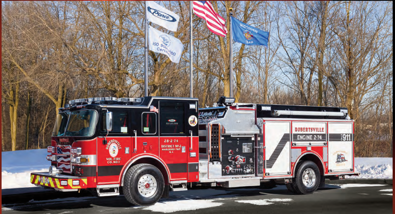
Pierce Arrow XT Pumper Marlboro Township District No. 2 Job #29004